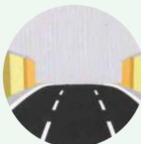
BLACK TOP ROAD