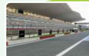
Budh International Circuit