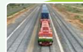
Frieght Corridor By Indian Railway