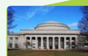
World Class Universities