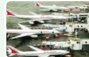
Jewar International Airport