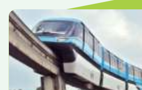
Proposed Mono Rail