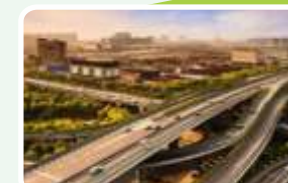
Delhi-Mumbai International Corridor