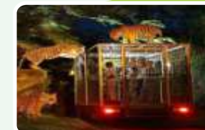
Proposed Night Safari