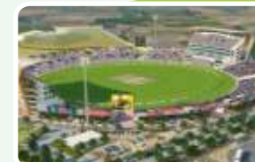
International Cricket Stadium