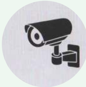
24 X 7 SECURITY