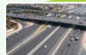
Eastern Peripheral Expressway