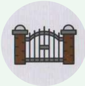
GATED AND WALLED SECURITY